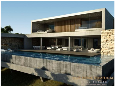
= 5 Bedrooms