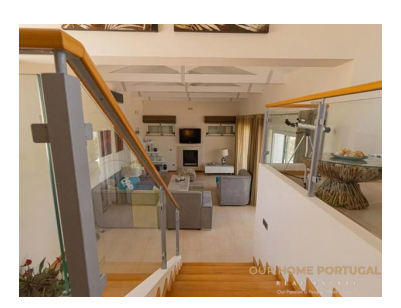
= 3 Bedrooms