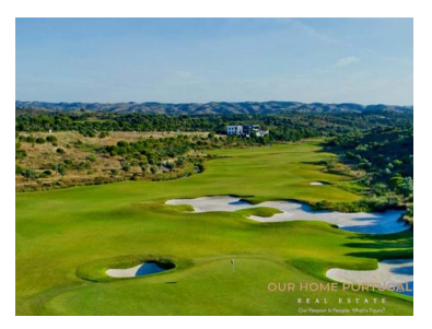
1105 Land Area (m²)